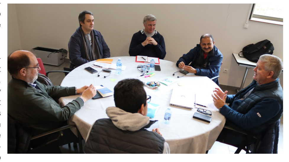
are discerned and accompanied.

Together, the participants discussed four elements: the quality of Marist life, guaranteeing spiritual pracfostetices, ring life-giving communities, and ensuring ministries that