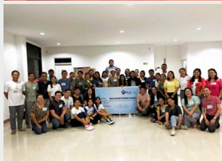
PHILIPPINES: MARIST EAST ASIA FORMATIVE ENCOUNTER