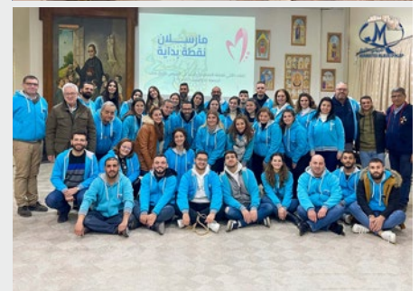
SYRIA: NEW VOLUNTEERS IN THE BLUE MARISTS