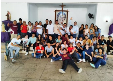
VENEZUELA: YOUNG PEOPLE FROM REMAR AND ANIMATORS OF ALL YOUTH MOVEMENTS