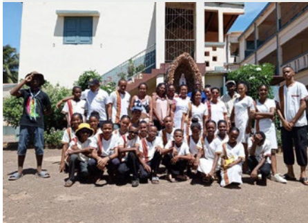
MADAGASCAR: THE MARIST FAMILIES OF DIEGO SUAREZ, WITH YOUNG PEOPLE, LAY AND MARIST BROTHERS