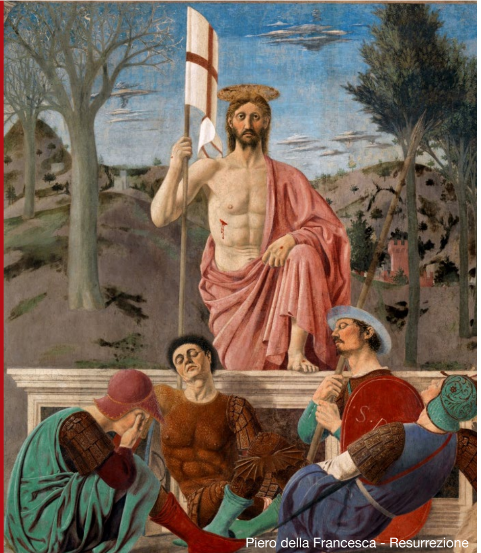
Piero della Francesca - Resurrezione

May the risen Christ enlighten our lives! Happy Easter!