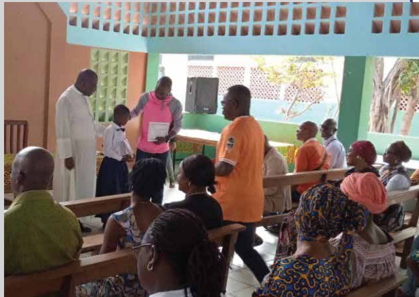
A student in form one emerges as best performing student in the entire school