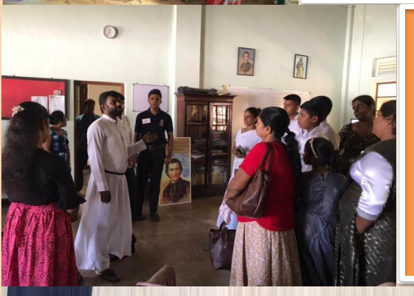
He added that the Lenten journey involves a struggle. It is a time for action, the Pope said, but also a time "to pause" – to pause in prayer and to pause "in the presence of a wounded brother or sister." Feb 1, 2024