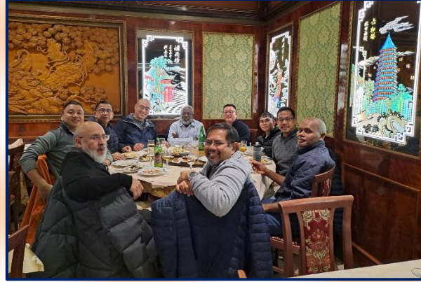
Asia Pacific brothers' supper out