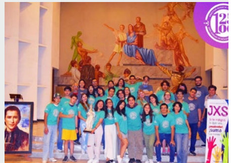
MEXICO: TRAINING COURSE FOR VOLUNTEERS, "TOGETHER FOR SERVICE"