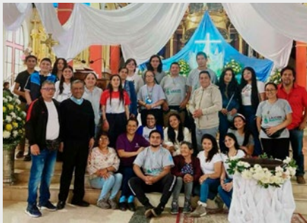
ECUADOR: NORANDINA PROVINCE HOLY WEEK CELEBRATION