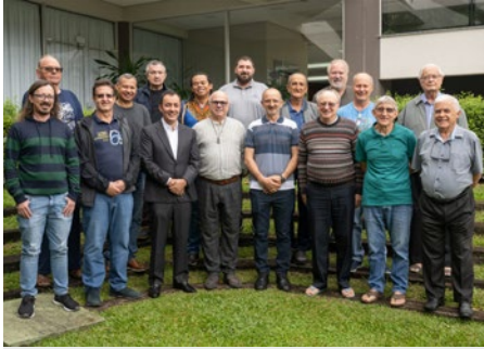
BRAZIL: MEETING OF BROTHERS COMMUNITY ANIMATORS IN CURITIBA