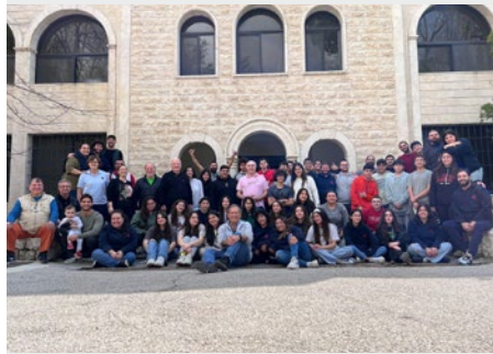
LEBANON: EASTER CELEBRATION