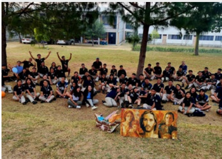
GUATEMALA: REMAR 2024 YOUTH MINISTRY ENCOUNTER