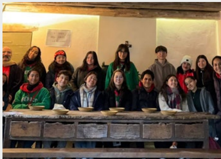
FRANCE: INTERNATIONAL EXCHANGE OF MARIST STUDENTS AT THE HERMITAGE