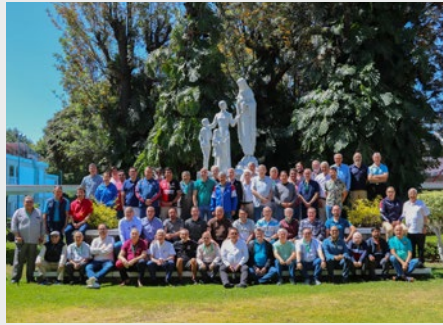
MEXICO: INTERPROVINCIAL ASSEMBLY IN GUADALAJARA