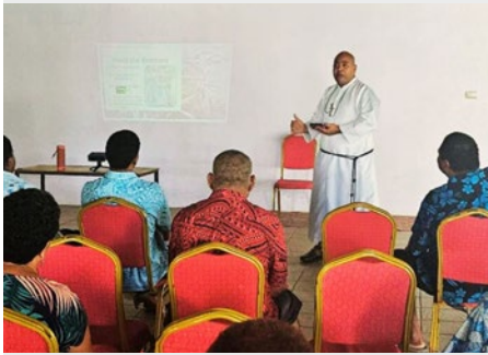
FIJI: VOCATIONAL AWARENESS PROGRAM OF THE FORMATION TEAM