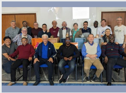
ITALY: ONGOING FORMATION PROGRAM AT THE GENERAL HOUSE IN ROME