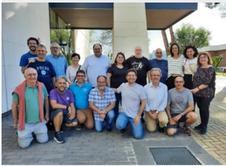
SPAIN: VOCATIONAL ENCOUNTER OF THE PROVINCES OF EUROPE IN ALCALÁ