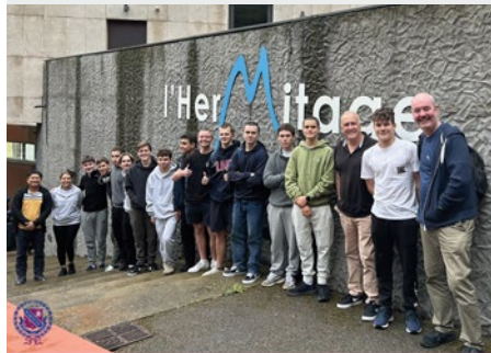
FRANCE: ANCIENT HISTORY TOUR AT L'HERMITAGE