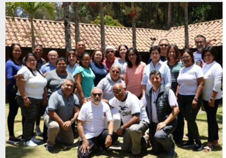
NORANDINA – VENEZUELA: MEETING OF DIRECTORS OF EDUCATIONAL INSTITUTIONS