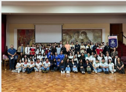
CHILE: STUDENT CENTER BOARD OF DIRECTORS MEETING