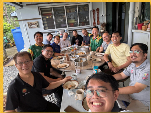
April 6: Breakfast with the Religious of Kuching.

Some photos of the Brothers' Retreat during the Holy Week at the Marist Asia Spirituality and Mission Center, Lake Sebu, South Cotabato.