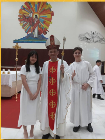
March 30: St. Joseph International School (SJIS), Kuching- One Form 4 student (girl), was baptized, first communion, and confirmed on Easter Virgil Mass, 30 March 2024, at the Sacred Heart Cathedral, KK. She is currently joining my BK classes for the 2025 SPM BK paper.