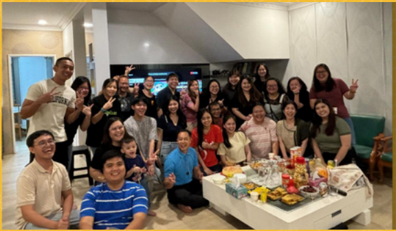
March 15: St. Joseph International School, Kuching- Gathering of teachers at our community