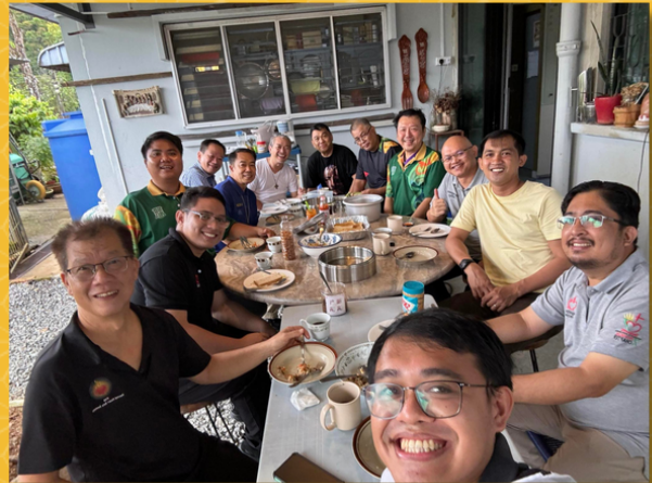
April 6: Breakfast with the Religious of Kuching at the SDB community.