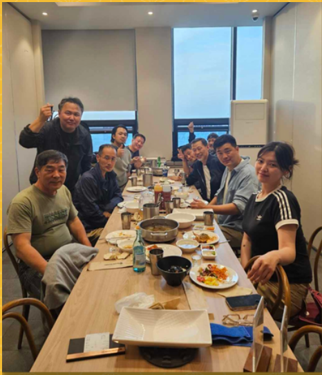
April 14: Seoul Community Meal Out