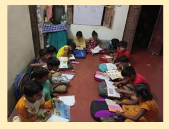
The Study Centers of Itachanga and Erua (Battar Police Station) in the village of Guskara.

The workshop on "Effective Method and Individualized Instructions"in our Formation House of Chandul, last 13 of April.