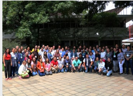
MEXICO: MARIST B-LEARNING ENCOUNTER IN GUADALAJARA