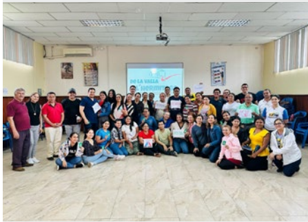
ECUADOR: WORKSHOP FROM LA VALLA TO L'HERMITAGE WITH 270 TEACHERS