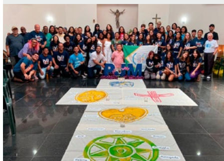
BRAZIL: MARIST YOUTH MINISTRY, PROVINCE BRASIL CENTRO-SUL