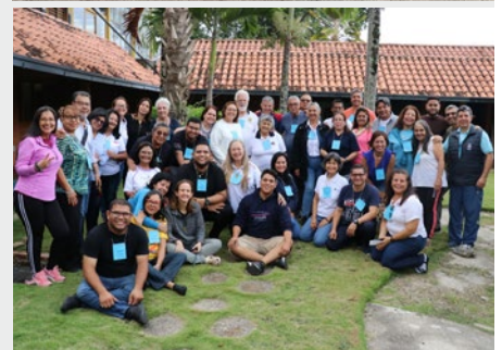
VENEZUELA: NATIONAL ASSEMBLY OF MARIST LAITY