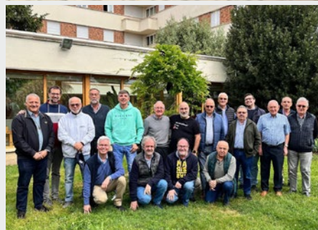
SPAIN: MEETING OF IBÉRICA COMMUNITY LEADERS