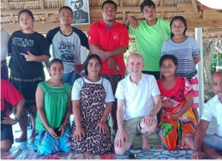
FIJI: BR. ANGEL DIEGO'S VISIT TO THE STAR OF THE SEA PROVINCE