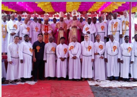
INDIA: CELEBRATING 50 YEARS OF PRESENCE