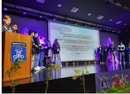
CHILE: MEETING OF THE MARIST STUDENT CENTERS 2024