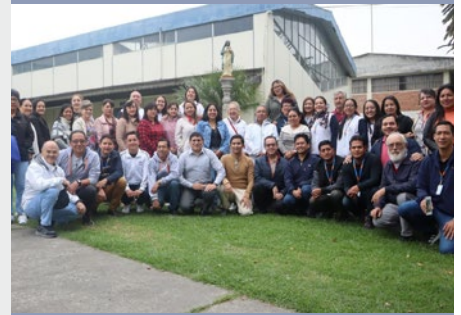
ECUADOR: MARIST EDUCATIONAL INSTITUTIONS DIRECTORS' MEETING