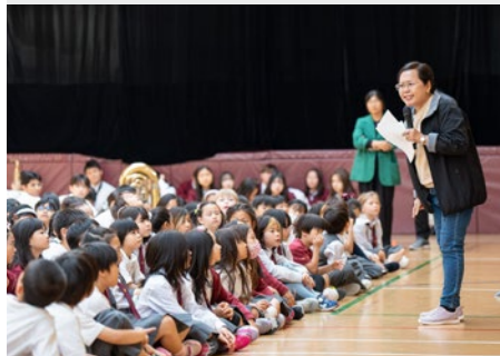
JAPAN: MARIST BROTHERS INTERNATIONAL SCHOOL, KOBE