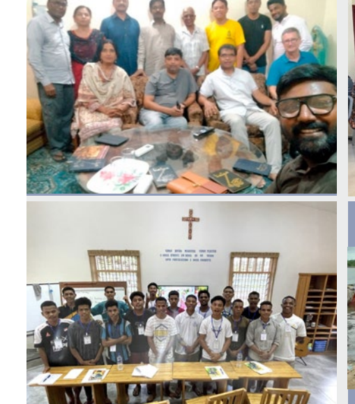
EAST TIMOR: "COME AND SEE" PROGRAM IN BAUCAU

ECUADOR: MARIST SPIRITUALITY TEAM REUNION