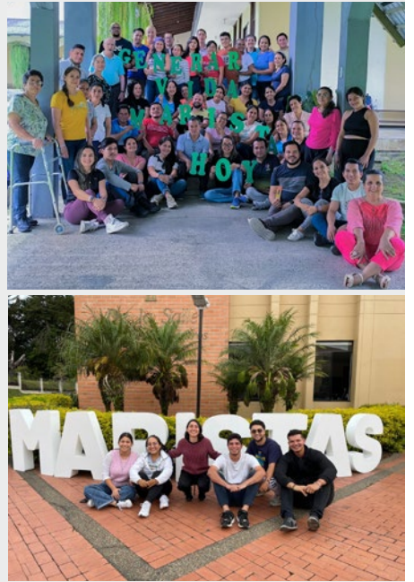
YOUNG PEOPLE FROM VENEZUELA, COLOMBIA AND ECUADOR TAKING PART IN THE NORANDINA PROVINCIAL CHAPTER