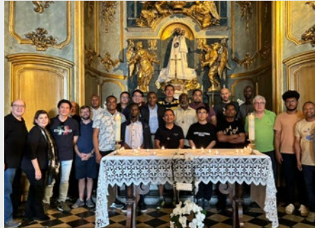
FRANCE: FORMATORS PARTICIPATING IN THE NEW BUILDERS OF L'HERMITAGE COURSE AT FOURVIÈRE