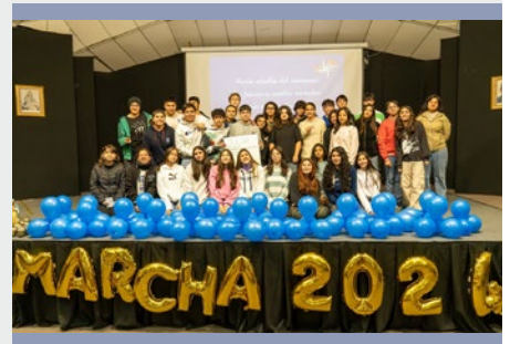
CHILE: PASTORAL MOVEMENT MARCHA