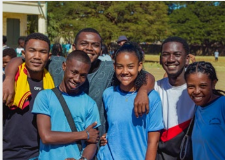
ADAGASCAR: LYCÉE CATHOLIQUE SAINT JOSEPH DE DIEGO