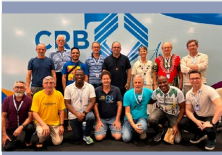
BRAZIL: MARISTS AT THE CELEBRATIONS FOR THE 70TH ANNIVERSARY OF THE CONFERENCE OF RELIGIOUS