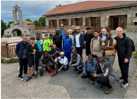
FRANCE: GIER 2024 ONGOING FORMATION PROGRAM