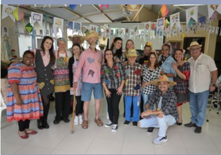
BRAZIL: FEAST OF ST. JOHN IN SÃO JOSÉ DOS PINHAIS