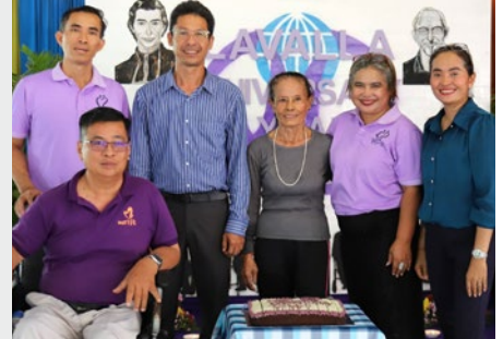
CAMBODIA: 26TH ANNIVERSARY OF THE FOUNDATION OF LAVALLA