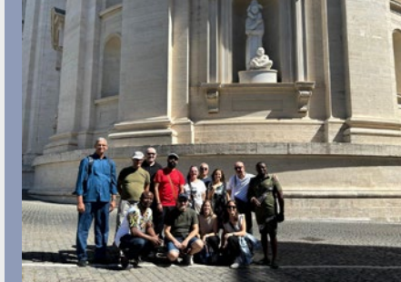
VATICAN: PARTICIPANTS IN SOLIDARITY ASSEMBLY VISIT CHAMPAGNAT STATUE