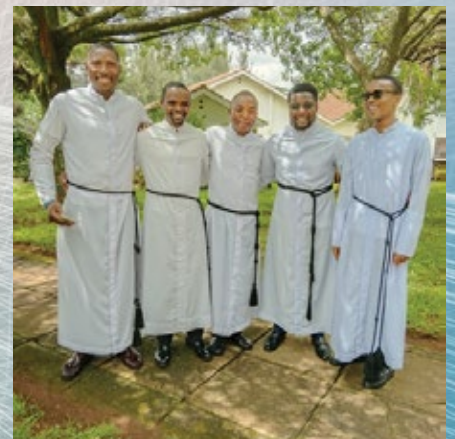
MIC - Nairobi