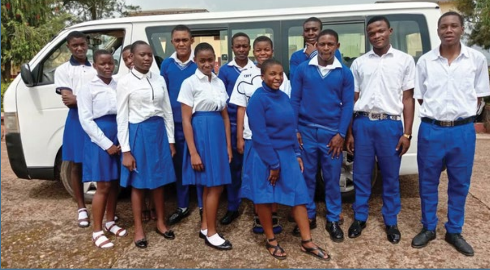
A cross-section of the form 5 students feeling excited after returning from the Computer Science GCE practical assessment