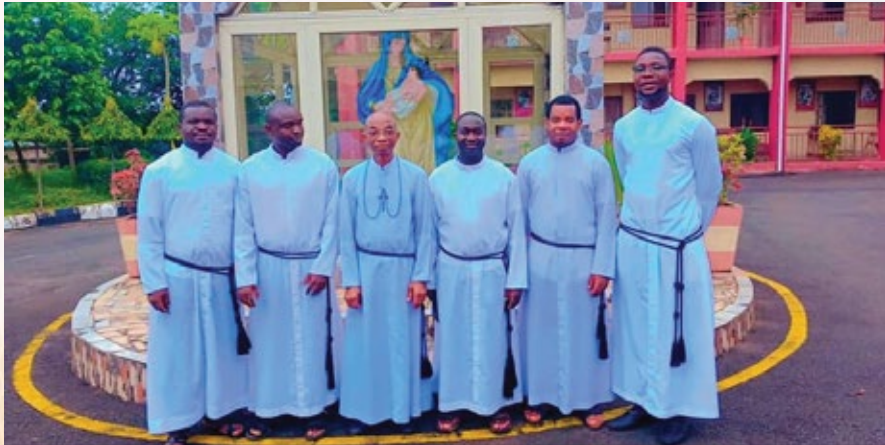
Tertianship 2024 - Nigeria