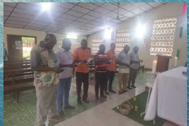
Bouaké, Ivory Coast