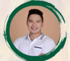
Eerl Phryme Depalubos Kidapawan