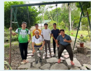
Marist Formation Workshop participants recently had the opportunity to meet and connect with the Community of Saint Marcellin Foundation in General Santos city, SOCCSKSARGEN, Philippines.