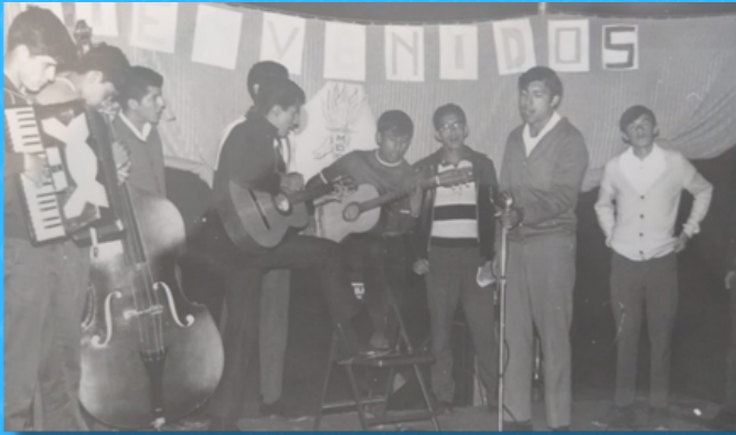
(The Juniors in photo [1969] are the same guys standing in front of the Sanctuary below [2024])